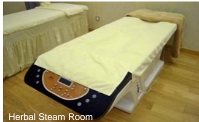
Herbal Steam Room