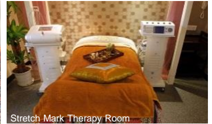
Stretch Mark Therapy Room