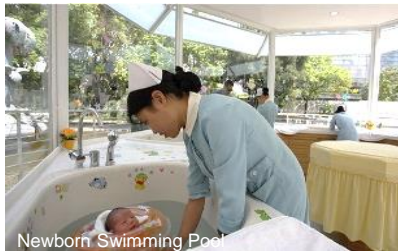
Newborn Swimming Pool