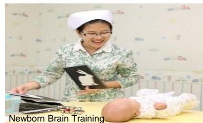
Newborn Brain Training